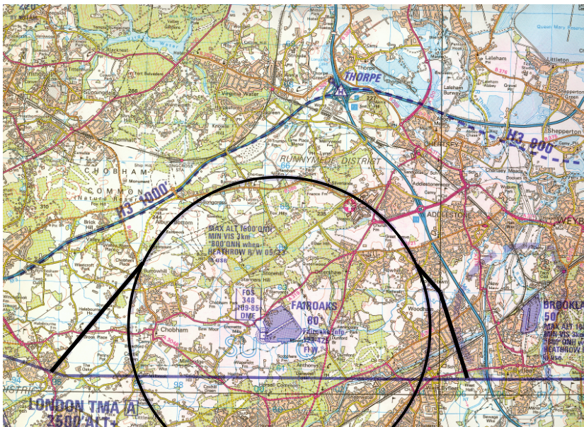
Fairoaks Local Flying Area

The majority of the Fairoaks ATZ is situated within the London CTR therefore special procedures are in place to enable flights to arrive at and depart from Fairoaks without the necessity of contacting Heathrow Radar. Additionally the ATZ has two fillets, one to the south-east and one to the south-west to facilitate entry to and exit from the ATZ.